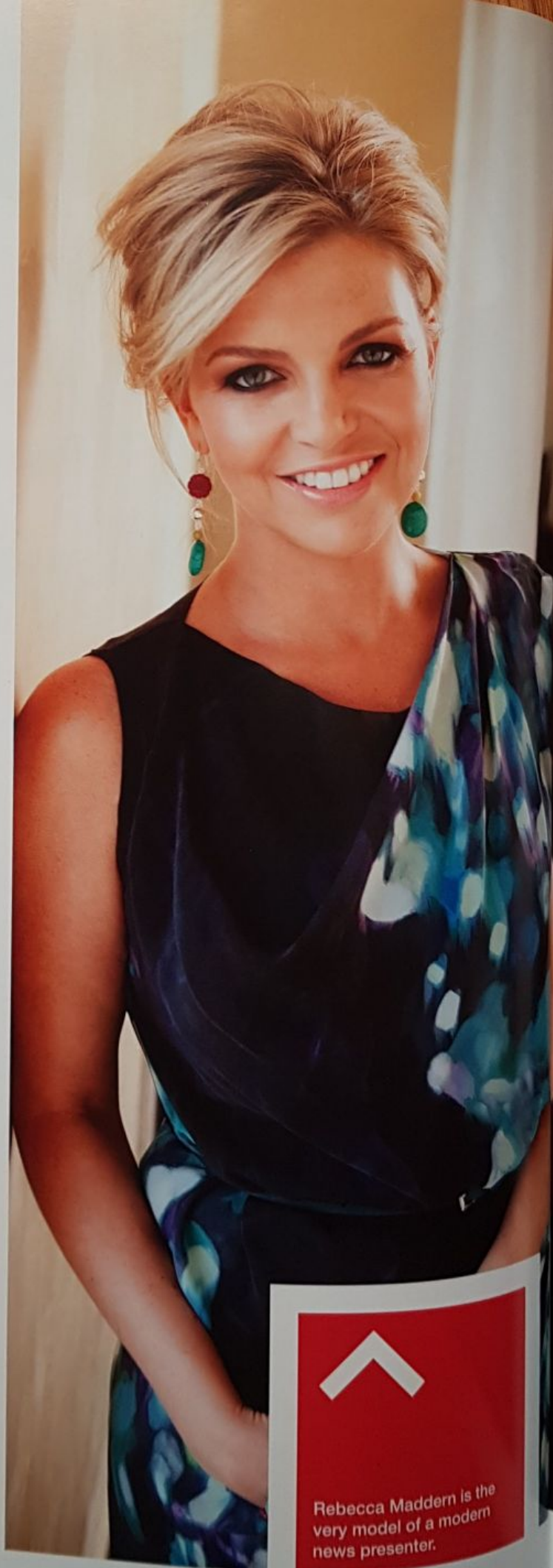
Rebecca Maddern is the very model of a modern news presenter.

I like gardening! I'm very interested in the progress of my new lime trees and my hydrangeas flowered quite well this spring.