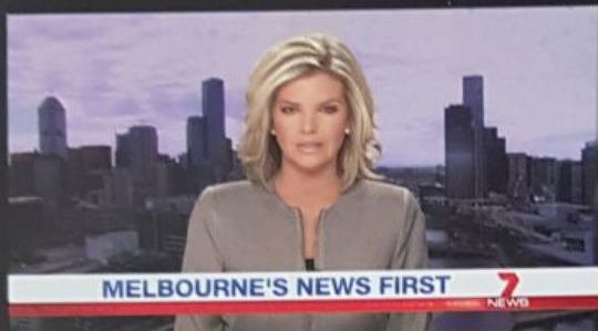
MELBOURNE'S NEWS FIRST